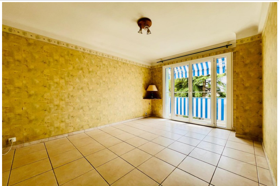
Apartment 1330 Nice