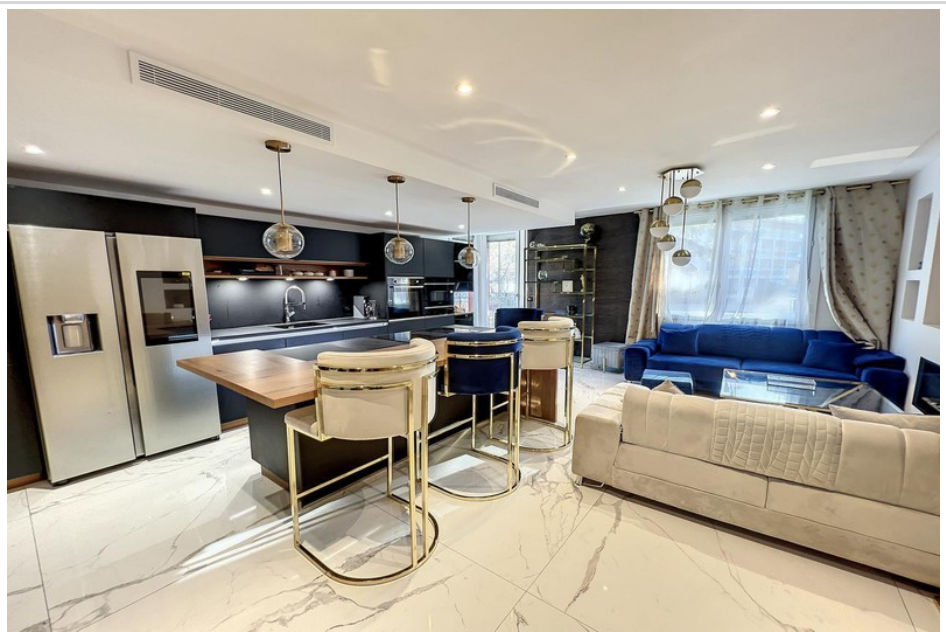
Apartment 5007 Nice