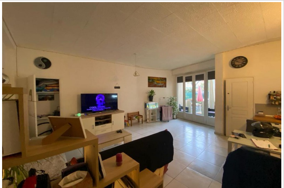
Apartment 957 Nice